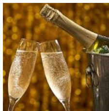
2024 Wedding Renewal Mass, Sunday, February 18 presided over by Msgr. Bazan. Only a few couples were in